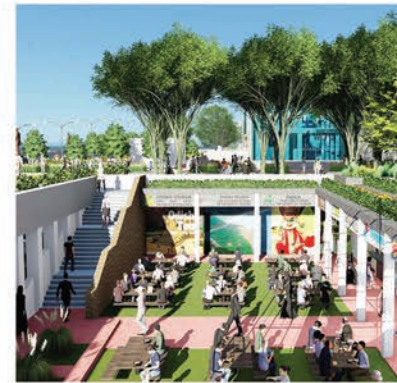
pictures above top -Museum Plaza with Sea Harrier and Submarine Museum; middle left -Submarine museum Entrance; middle right - TU142 Museum Entrance yard; above from left -Submarine Interior view, Sea Harrier Museum, Submarine Museum courtyard with shops tourism stalls; right - graphics on the building facade as a deisgn element, extreme right - Information display panel with lighting poles and vendor platform