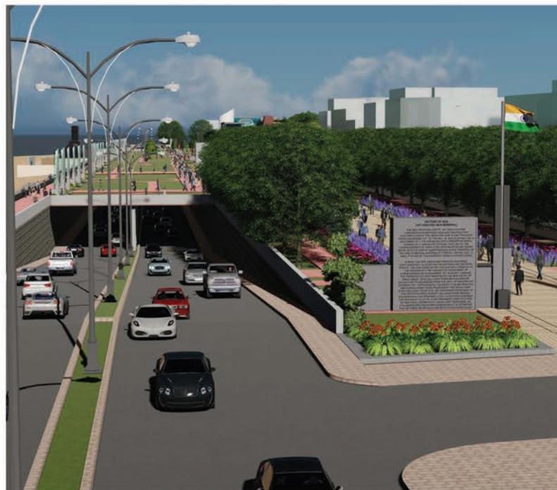
pictures above top -view showing entrance to the subway from the southern end near the Police Guest House; left above -the plaza area above the subway, near Victory at Sea; left - underground parking overlooking the courtyards; above - approach to subway from northern end, near YMCA.