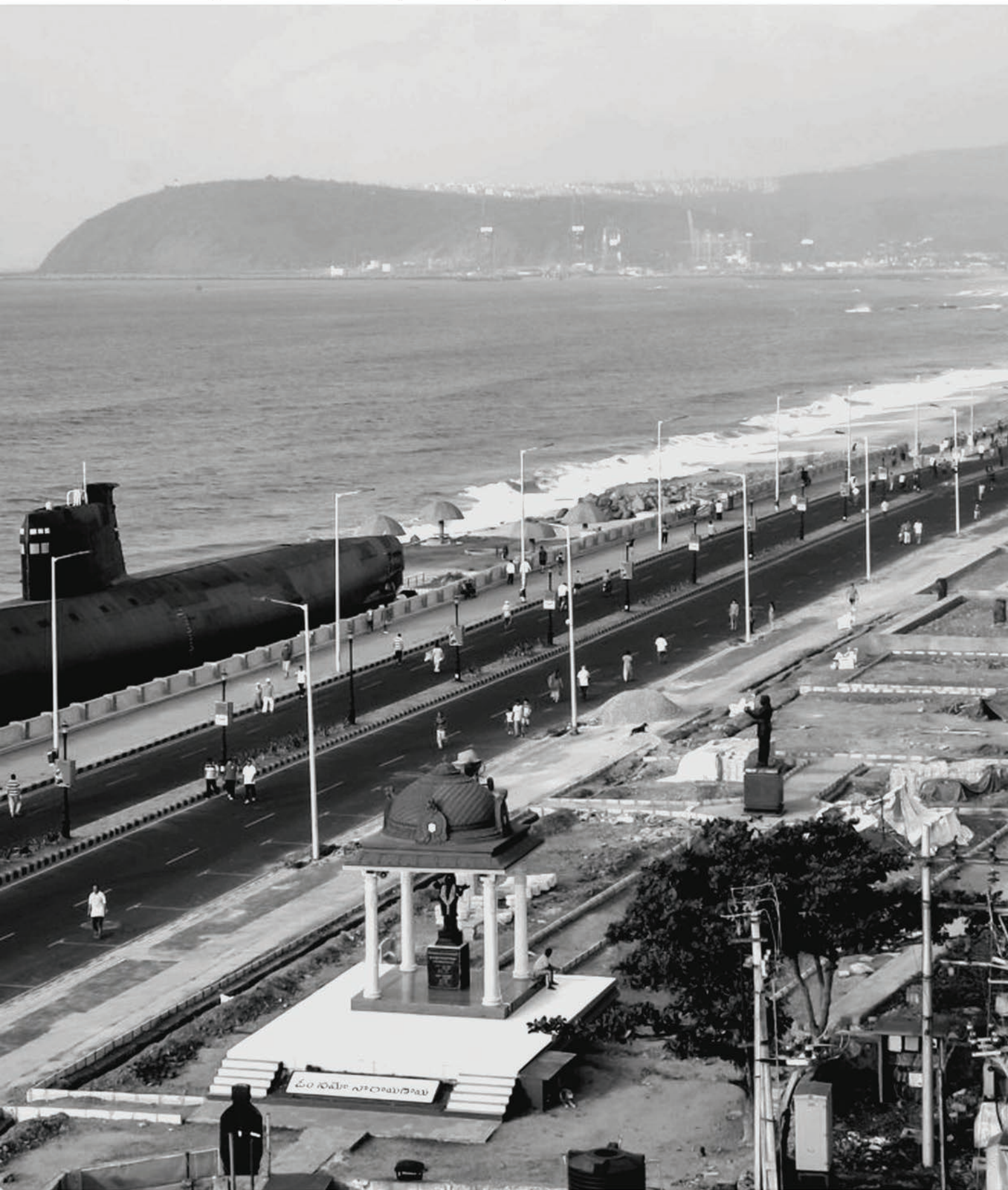
picture above Beach Road stretch, selected for the integrated Tourism and Museum Complex.