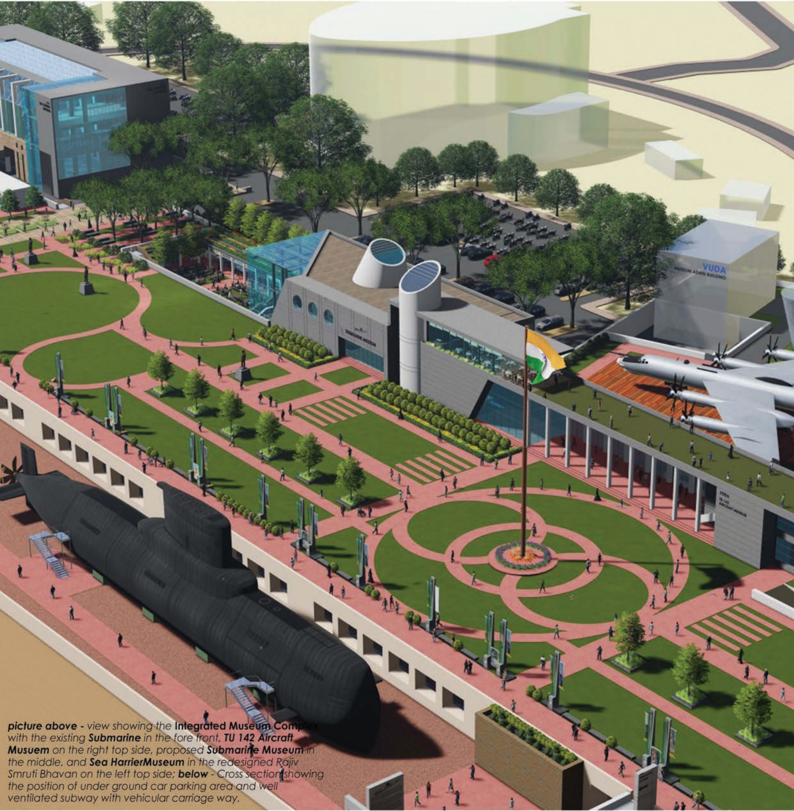
picture above - view showing the Integrated Museum Complex with the existing Submarine in the fore front, TU 142 Aircraft Musuem on the right top side, proposed Submarine Museum in the middle, and Sea Harrier Museum in the redesigned Rajiv Smruti Bhavan on the left top side; below - Cross section showing the position of under ground car parking area and well ventilated subway with vehicular carriage way.