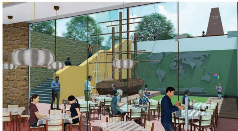
pictures above top -view showing the Victory at Sea surroundings; left below - approach to the coffee shop sunken court; right middle - entrance view of the Victory at sea monument; right bottom -view of the courtyard from the coffee shop; left page - View of Victory at Sea monument and Tourist information panels