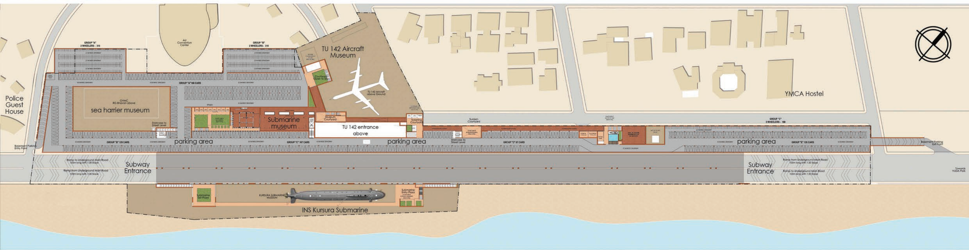
picture above top - conceptual visualisation of the proposed project; above- Plan at basement parking and underground carriage way level